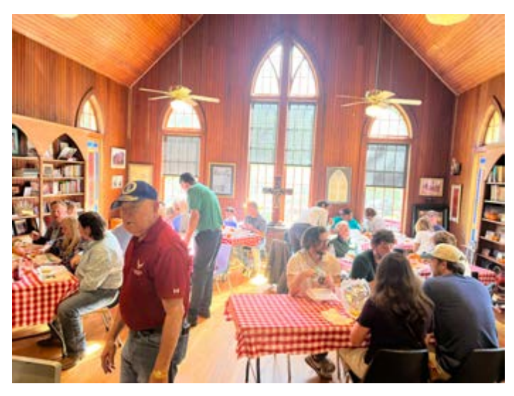
Guests enjoying the food & fellowship