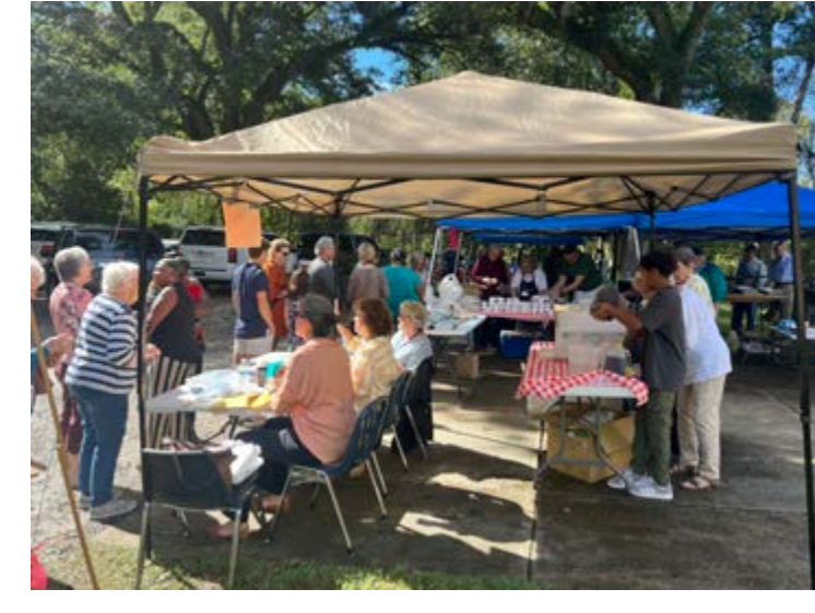
The fish frying team